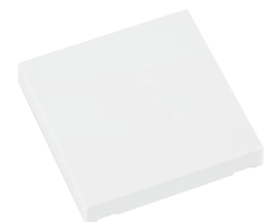
1x ON/OFF RTS22-ACC-02-xxP