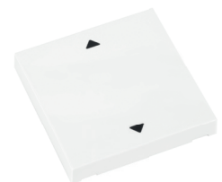
1x ON/OFF RTS22-ACC-03-xxP