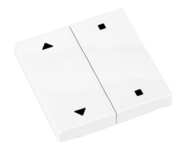
1x UP/STOP/DOWN RTS23-ACC-03-xxP2